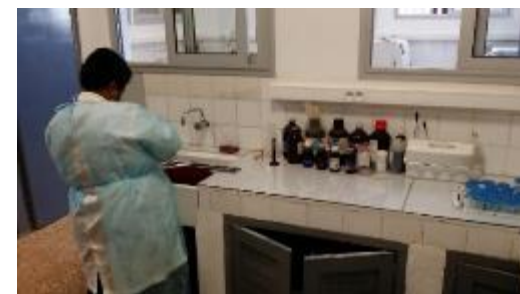
Lab before and after renovation, Madagascar