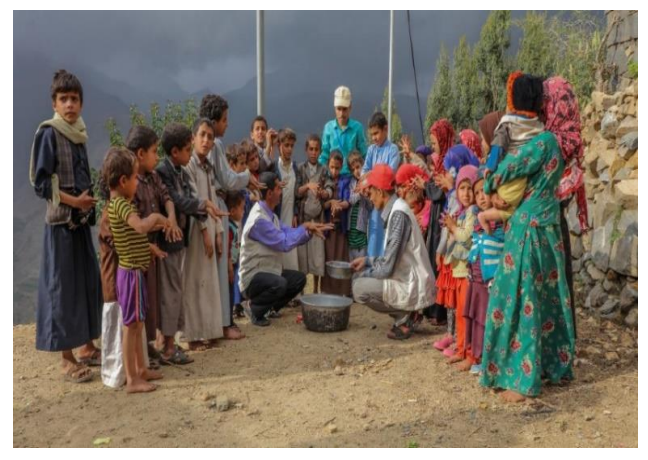
GARWSP, Yemen (2019)