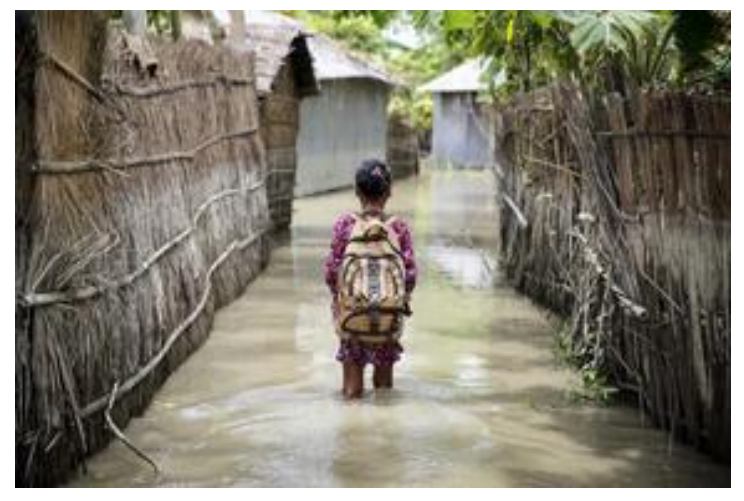
UNICEF, Bangladesh (2018)