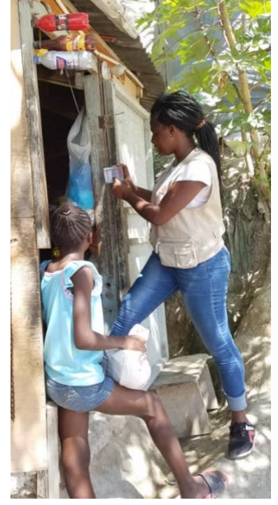
Solidarities International, Haiti (2019)