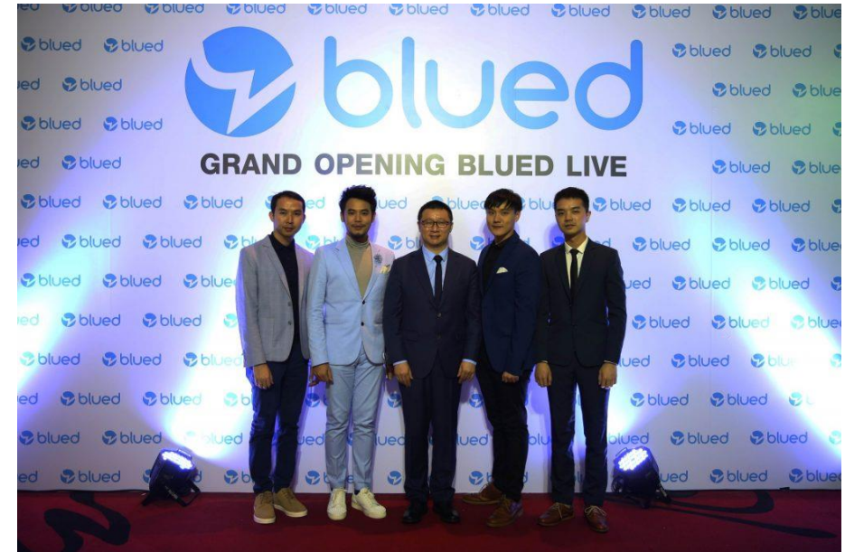
Finalists in hackathon to be interns at gay tech company, Blued