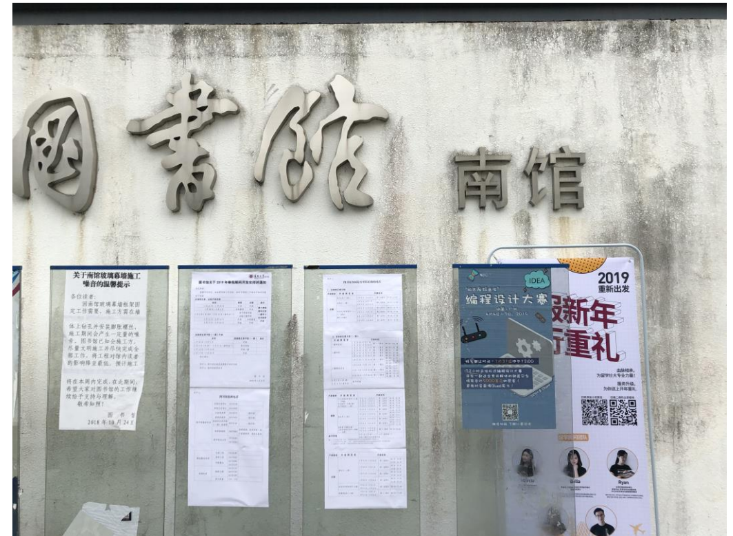
SESH hackathon call for submissions Shenzhen, China