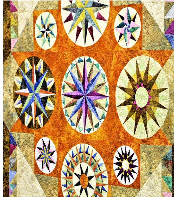
Award winning quilt.