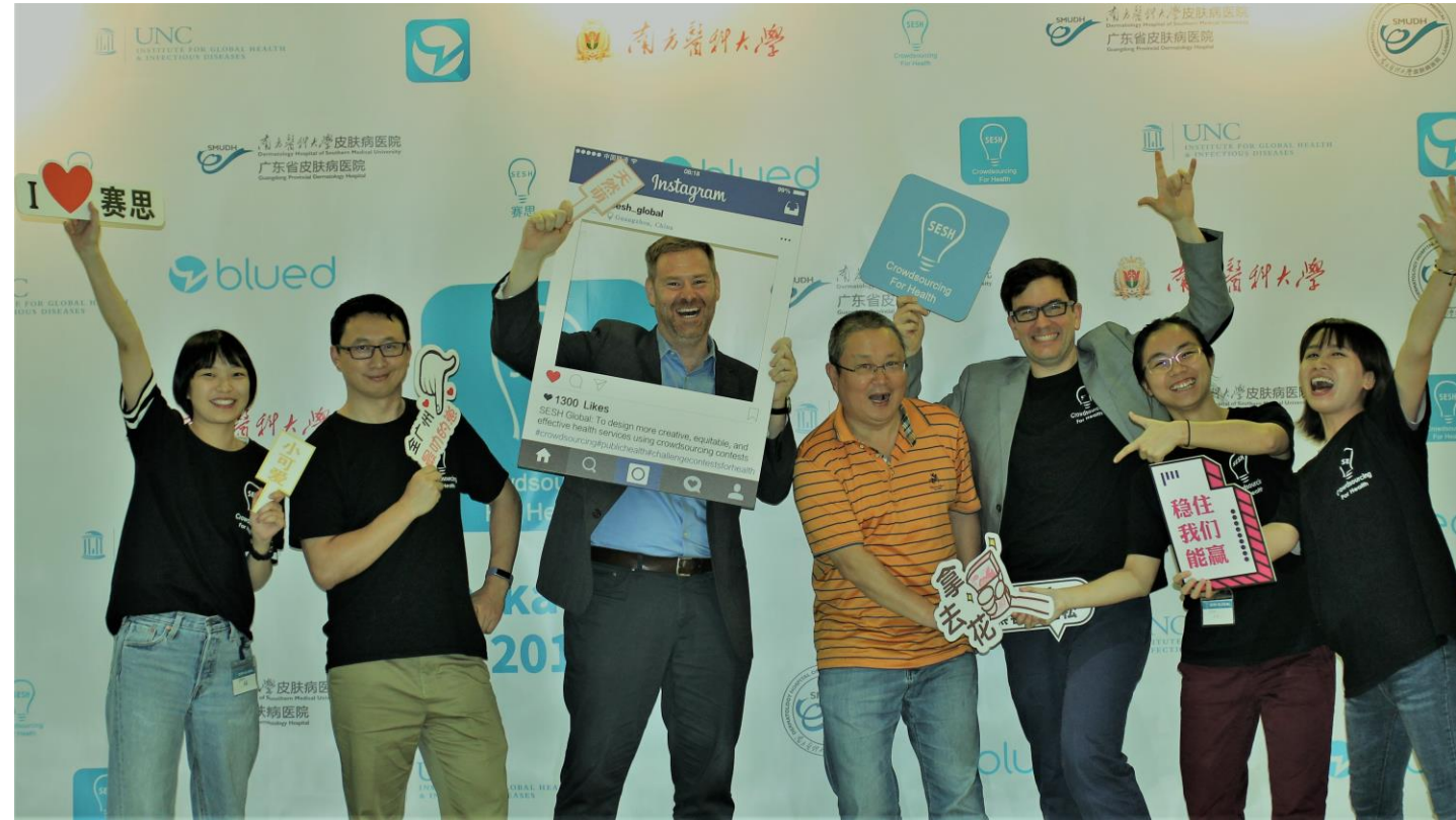
SESH hackathon, May 2019. Guangzhou, China