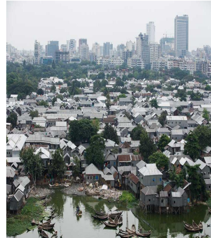
Slum in Dhaka